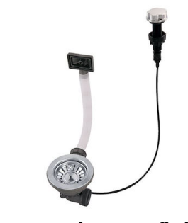
Automatic waste fitting 8407 100