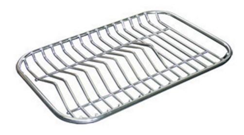
Stainless steel plate rack 8100 280